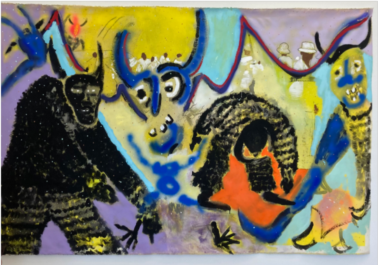
Figure 2: Curtis Talwst Santiago, "Untitled," 2022, spray paint, oil, charcoal, pastel, and acrylic on canvas. 59 inches x 102.37 inches ( 149.9 cm x 260 cm).

including lard, grease, oil, and tar. The combination of the molasses, the adornment of horns, and brandishing of pitchforks culminates in the Jab Molassie. The costume and general visual of the figure (and related) had shifted in the subsequent decades. Rather than solely red, they became khaki, slate, and cobalt blue. Other features changed as well, like the plaited hemp leaves, adornment of thick horns (padded headpiece), long tails, and pitchforks. Within Carnival, certain Jab Molassie are held back with shackles and covered with soot, reflecting on the realities of slavery and life on the sugar plantations. Traditionally, the Jab wears a heart-shaped cloth adorned with glass, mirrors, sequins, and other ornaments.