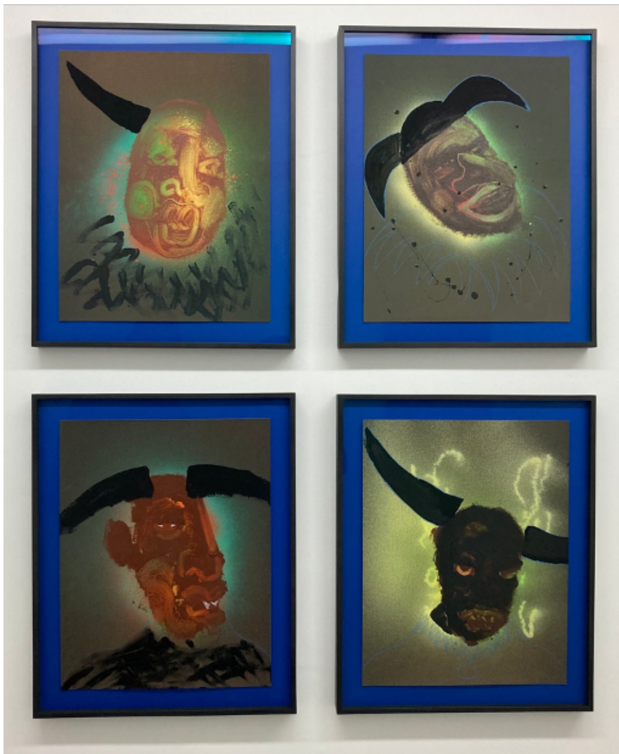
Figure 5: The four individual works share the following details: Curtis Talwst Santiago, "Jab Molassie Posse," 2022, mixed media on paper, 18 inches x 14 inches (45.7 cm x 35.6 cm).