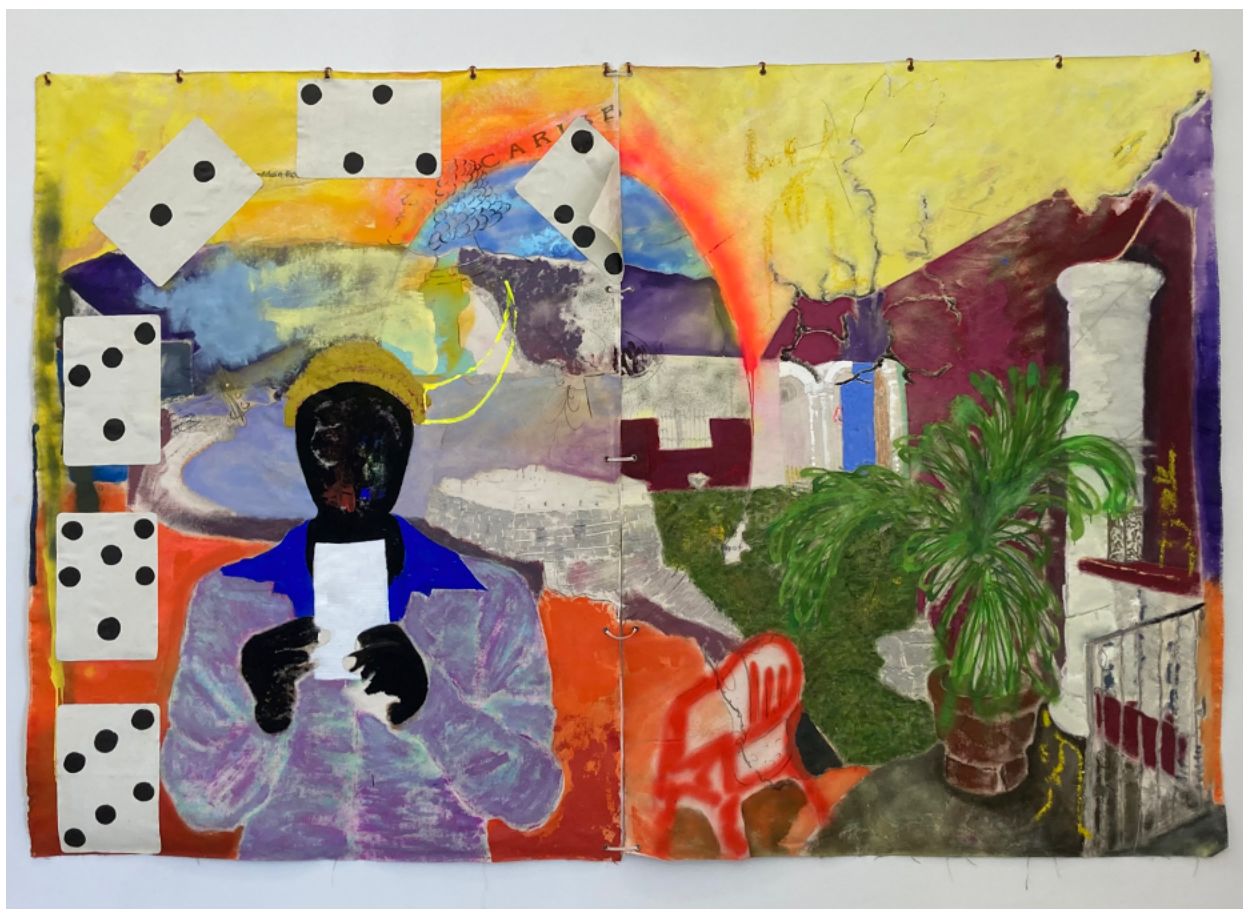
Figure 3: Curtis Talwst Santiago, "The Places We Will Come and Will be From," 2017 - ongoing; spray paint, oil, charcoal, pastel, acrylic, laces, and grommets on canvas, 100 inches x 144 inches (254 cm x 265.8 cm).

Jab as they are recognizable to those familiar with Carnival. The Jab is an integral figure since it embodies the shift in freedom which is at the essence of Carnival.