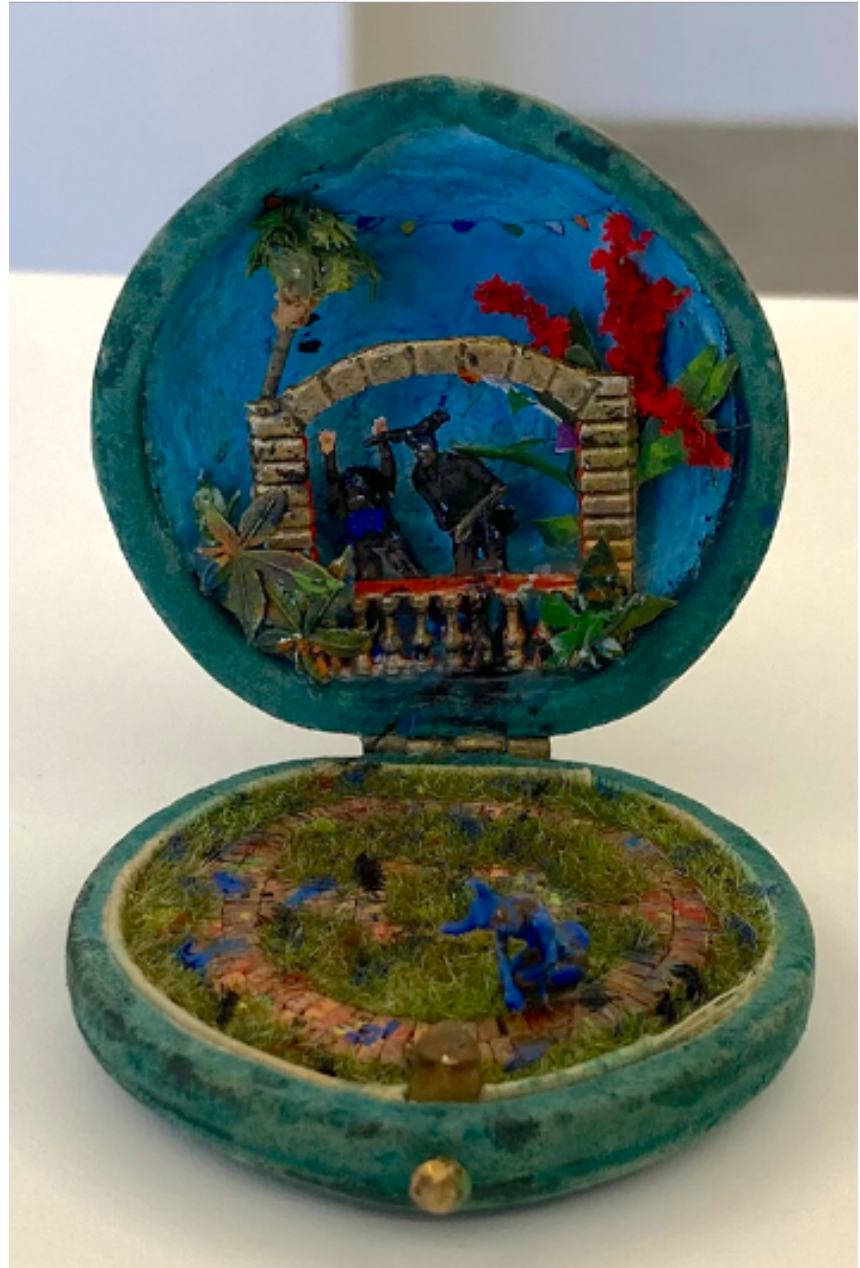
Figure 4: Curtis Talwst Santiago, "Jab Women, Jab Jab Posse," 2023, mixed media in reclaimed jewelry box, 3.5 inches x 2.5 inches x 2.5 inches (8.9 cm x 6.4 cm x 6.4 cm).

by putting the Jab within a compact mirror, rather than a mirror upon the Jab. This placement reinforces the act of reflecting upon the Jab, echoing the meditation of a prayer bead.